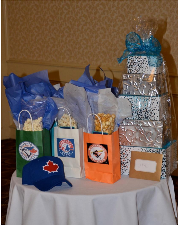
Thank you from the Planning Committee